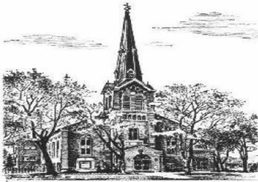
ST. JOHNS LUTHERAN CHURCH - LANCASTER, NY Churches Granted 1894